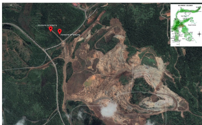
Figure 1. Location of rhizosphere taking of host plants on land contaminated Cr, Co and Cd.

Concentration of soil heavy metals was measured while in laboratory of chemistry, Polytechnic of Ujung Pandang, Makassar, using manual book of X-Ray Florence Spectrophotometer/Bruker/S2 Ranger, Heavy metal concentration in soil can be seen in table 1. The coordinate determination of host plant rhizosphere taking location was determined using the Global Positioning System (GPS) Coordinates Finder (Figure 1).